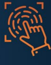
Implementing or enhancing a Zero Trust model