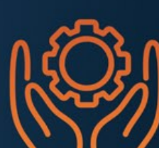
Lack of support from senior business leaders or the Board