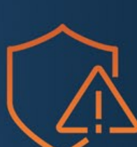
Alert / security data overload