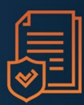
Better measuring effectiveness of our security program