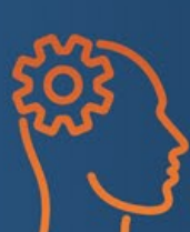
Lack of skilled personnel