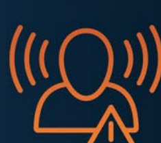
Low security awareness among employees