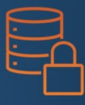
Better ensuring the privacy of customer data