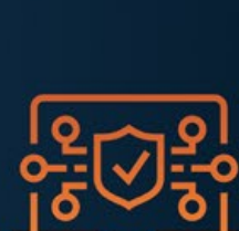
Security service edge (SSE) platform