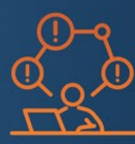
Better addressing partner or supplier risk